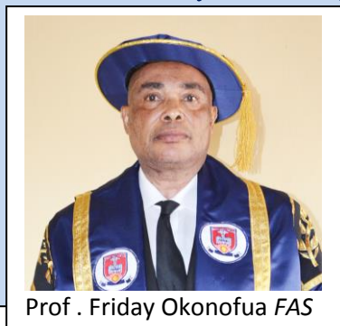
Prof . Friday Okonofua FAS

Oyebade said the duties of the new appointees shall include ‘fostering, developing, monitoring and accessing the academic standards of all the courses within the department’. They are also expected to assign courses to lecturers, monitor their performance, oversee the conduct of various examinations, counsel and discipline of staff and students as may be required.