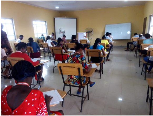
UNIMED students during 2nd semester exams