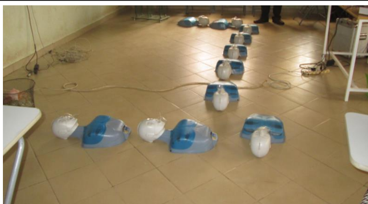
Models used for basic life support training