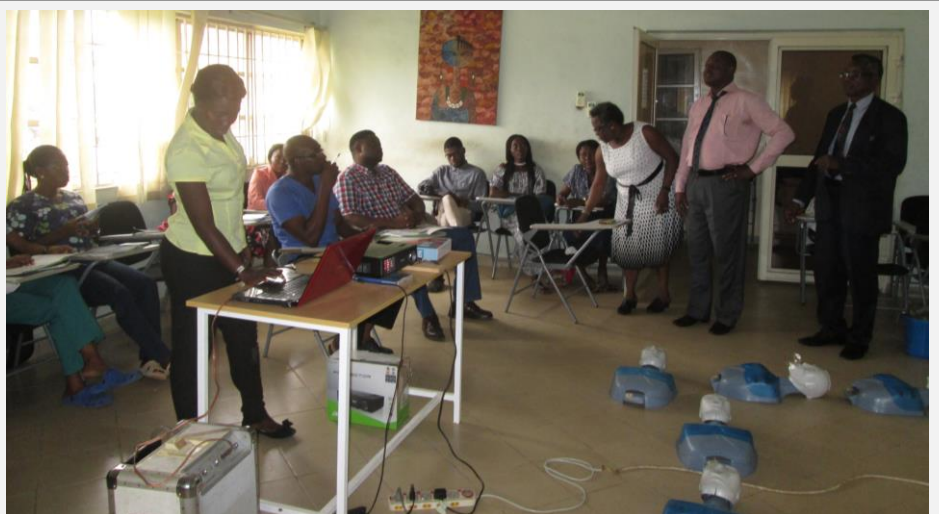
A cross section of participants during the Basic Life Support training inside the conference room of the Mother and Child Hospital, Ondo.